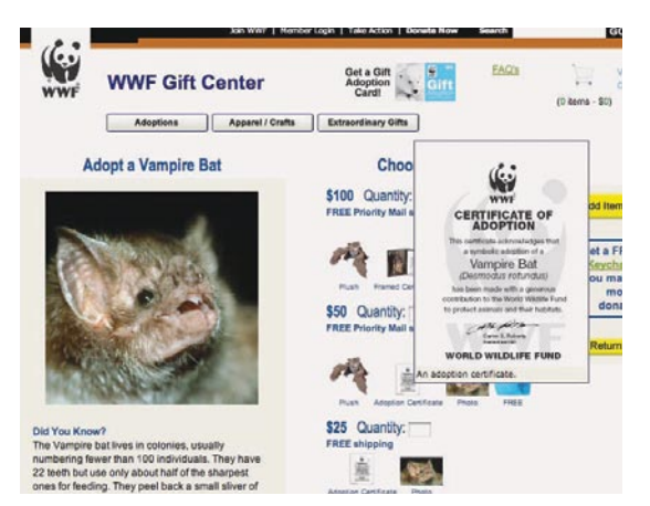
Up for adoption: the vampire bat.